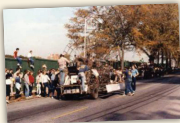
ZBT's Wreck in 1982.

Did you help build one of Phi Ep's or ZBT's contraption wrecks for the Ramblin'