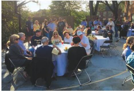
Alumni gather for Homecoming tailgate

These weekends are precious reminders of why we stay in touch. We hope to see everyone again in 2018!