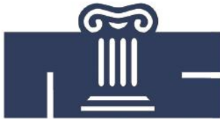
North-American Interfraternity Conference