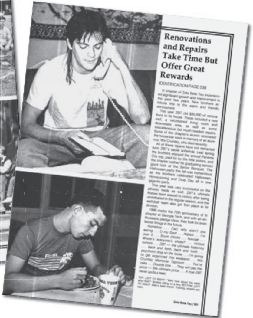
BOTTOM, LEFT TO RIGHT: Man's best friend. Training wheels are next.