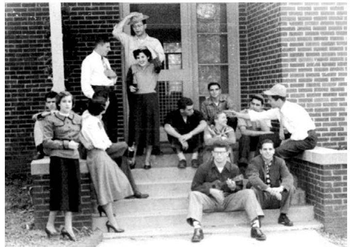
A scene repeated through the years — brothers and friends hanging out on the front porch of the new Phi Ep house — 1951.