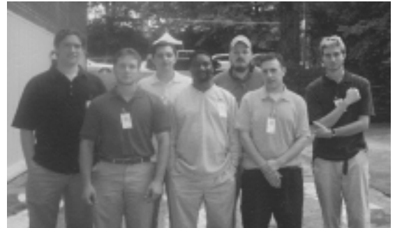
Some of the new members gather before Homecoming events to help set up.

Yes, we still have some miles to go. But with your help, I’m sure that we’ll get there. Thanks again for all you’ve done. ■