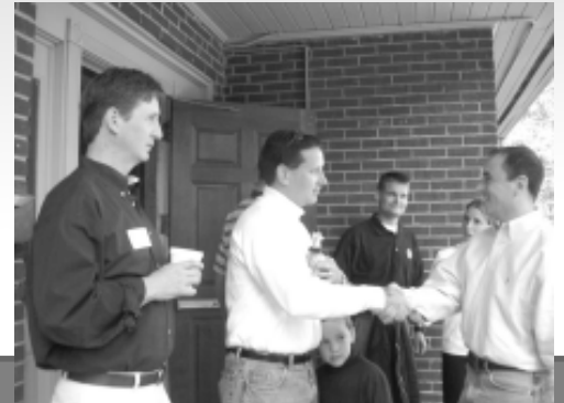
Alumni enjoy Homecoming 2003.