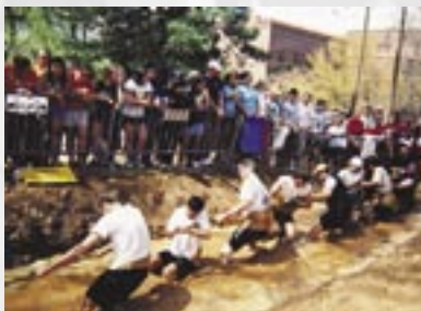
A scene from Greek Week 2004.

Stay tuned for announcements of future openings of our photo vault, as plans are in the works for photo collections from additional eras in our chapter's history to be posted on our Web site at www.gtzb.org . Which years will be next? Check our Web site often, so you'll be the first to know!