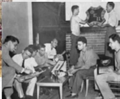
The Phi Ep scene at Tech, 1949.