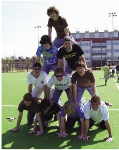
A Xi Chapter pyramid! ZBT brothers literally climbed their way ahead of larger fraternities to place 11 th in Greek Week this Year.

The brothers implemented a successful meal plan this year upon moving into the house and plan for an expanded and improved version next year.