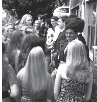
New members serenade sorority pledges in annual Run of the Roses.

This past spring, Xi Chapter sponsored the annual Get on the Ball fundraiser for Children's Miracle Network Hospitals (CMNH), raising over $2,400 for this worthwhile charity. Brothers rolled the ball on campus, at Atlantic Station and at Georgia State. In addition, ZBT partnered with Phi Mu sorority and Dance Marathon at Georgia Tech in fundraising efforts for CMNH.