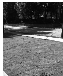
Portion of new sod installed on front lawn

It should be noted that Georgia Tech owns the plot of land between ZBT and Kappa Sigma, which has been used by members of both fraternities for parking for many years. In the past few years, Tech has been looking to take over this plot of land, and they have announced plans to do so at the end of summer. Since our property line runs near and parallel with the retaining wall between our yard and the parking area, we will still have an area outside the basement door for parking and wreck construction. Updated information will be provided once Tech has decided a final use of the plot.