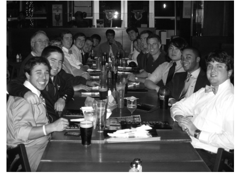
Undergraduates and alumni enjoy the end of fall semester 2013

Finally, in athletics, we competed in four leagues this spring and almost made the playoffs in each one, missing by just one game. Next semester, we plan to make it to the playoffs in each sport.