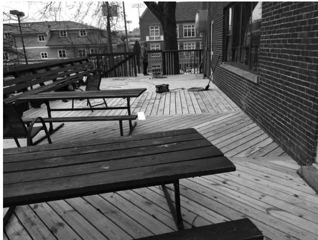
The chapter house deck took on a new look in February during a major rebuilding project.