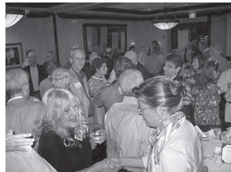
Class of '74 Reunion 2014