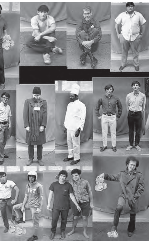
New Zonkers 1970

Read some of the best memories from throughout the last 100 years and share your own! We've got stories of Phi Ep brothers shutting down an all-you-can-eat buffet in the '50s, Room Pride in the '70s (which involves some clever pranks), and pledges moving all of the house furniture to the roof in the '70s. Visit www.gtzb.org for much more.