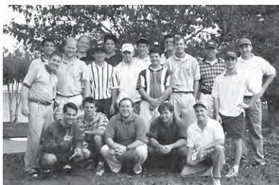
Alumni Golf Tournament 1996