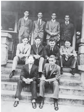
Phi Ep 1933