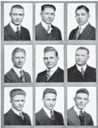
Xi Chapter Founders