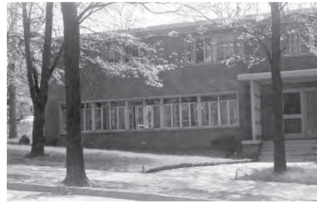
New House 1950