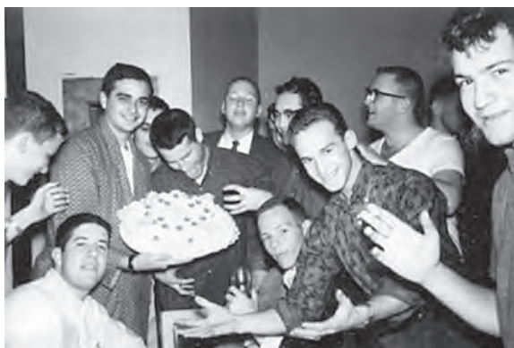
A birthday celebration in the 1950s