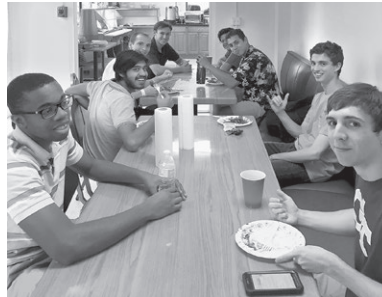
Brothers enjoy new dining room furniture

In our last issue, we reported the renovation of our serving room. Since then, we have completely refurbished the dining room to support the new chapter meal service. The furniture is booth style, lending itself to a “ZBT Diner” motif. Altogether, we have capacity for 32 brothers at any given time. In addition, the brothers can use this new arrangement for studying and group projects during non-meal times. They are quite happy with it.