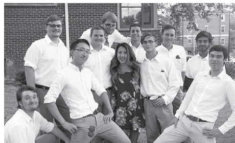
Brothers prepare for the Run for the Roses

Fall rush saw four new brothers for ZBT. Unfortunately, numbers were down for campus as a whole. The brothers have implemented