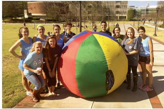
The “Get on the Ball” philanthropic project began in early March.

On the philanthropic front, the chapter attended Dance Marathon on March 4 in