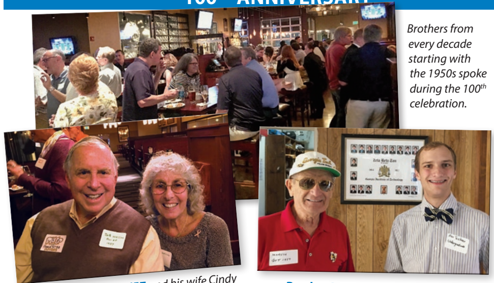
Brothers from every decade starting with the 1950s spoke during the 100 th celebration.