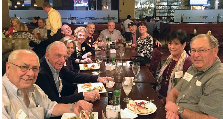
Alumni enjoy their meals during the 100 th celebration.

This past October, we celebrated one hundred years of Xi Chapter at Georgia Tech, 1916–2016. Brothers and alumni gathered from across the country the night before Homecoming at Gordon Biersch in Buckhead, where we rented out the restaurant to accommodate all the alumni and guests.