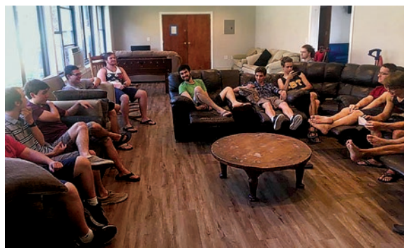
Brothers enjoy the newly renovated living room.