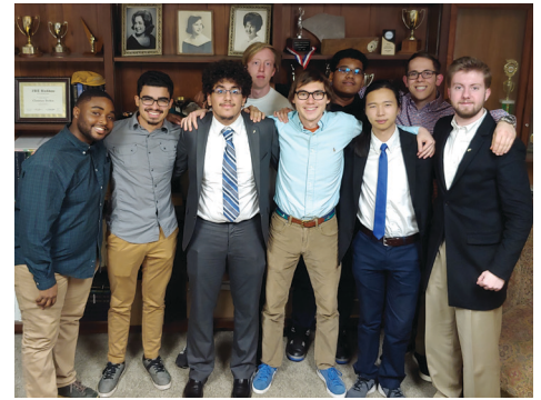
ZBT Recruitment Class

Brothers are not confined to leadership within the Fraternity. They are taking advantage of all the campus has to offer. Here are a few